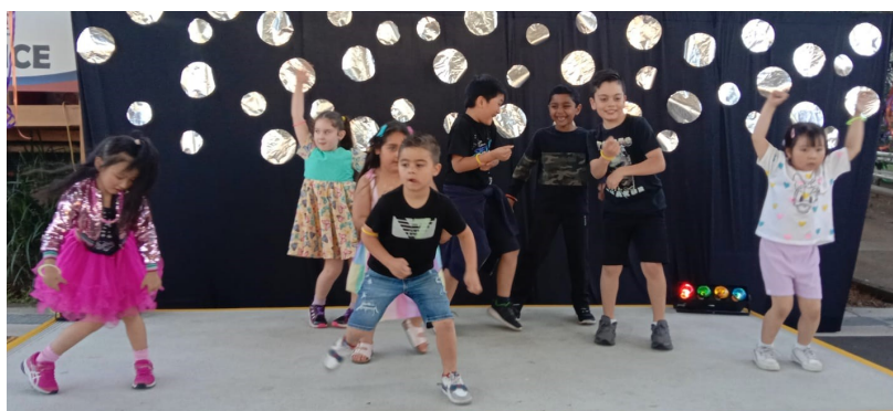
Some great dance moves at our Term 3 after school disco.

Wishing all of our students a productive, successful and fun term of learning.